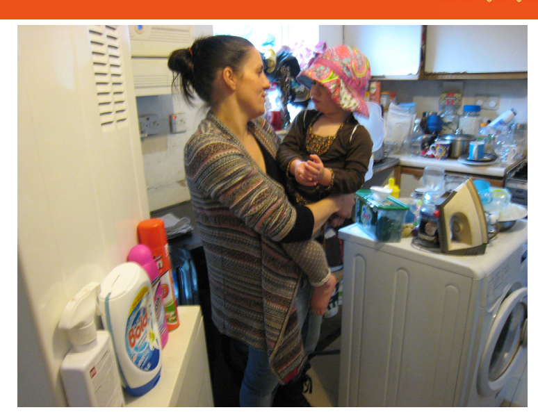
130 people died in B&H in 2013 from winter cold, is this fair?